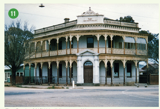
The Bank of NSW building, now Westpac.