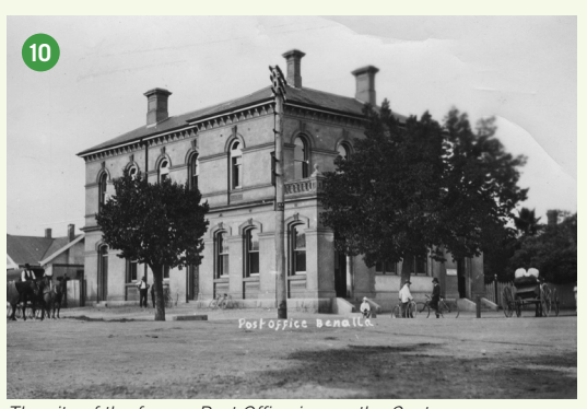
The site of the former Post Office is now the Customer Service Centre for Benalla Rural City Council.