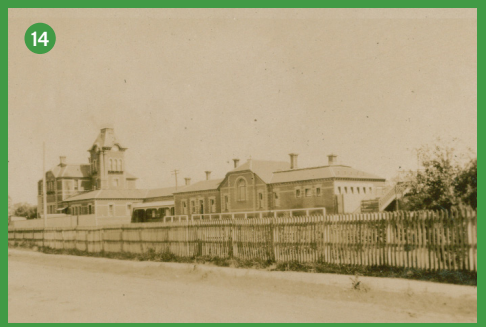
The Benalla Railway station.